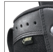
High quality materials