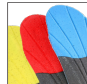
HAIX® Vario Wide Fit System