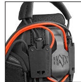
HAIX® RAPIDFIT System