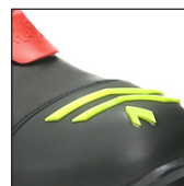
HAIX® High Durability Cap System