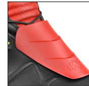
HAIX® 3Z Protector System