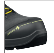
HAIX® Nano-Carbon Toe Cap